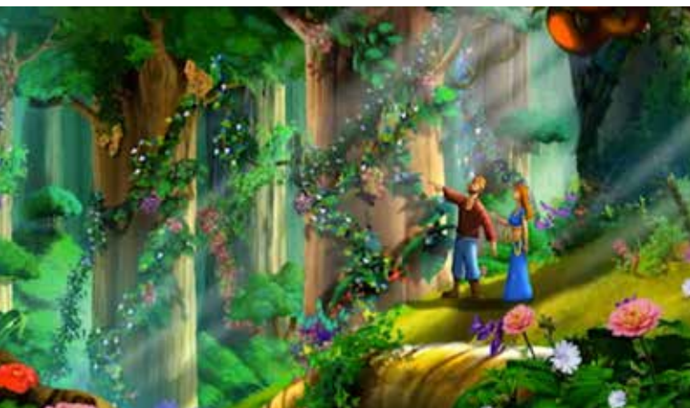
Creationist worldview vs. evolutionist worldview